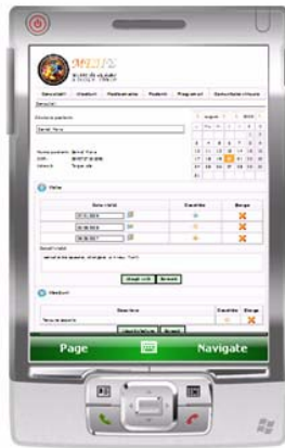
Figure 1. The mobile interface of MEDIS

functionalities. Based on this premises, MEDIS promotes an innovative approach that facilitates the interconnection between the clinical practice environment and medical education actors that can prepare future generations of medical personnel to integrate CDSS in their daily activity. Students and teachers can directly access, based on privacy and security restrictions, the knowledge database of MEDIS, they can interact with physicians and have access to their comments and recommendations. The connection to this practice based environment increases student performance and generates potential for interconnections with other media.